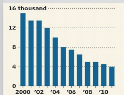
Estimated execution numbers in China